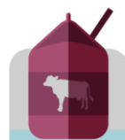
3. COW'S MILK