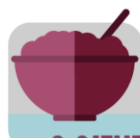
8. OATMEAL AND FORTIFIED CEREALS